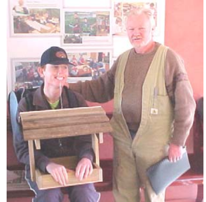
The Master (Wayne) & apprentice