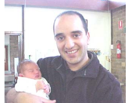
Portrait of a very proud father