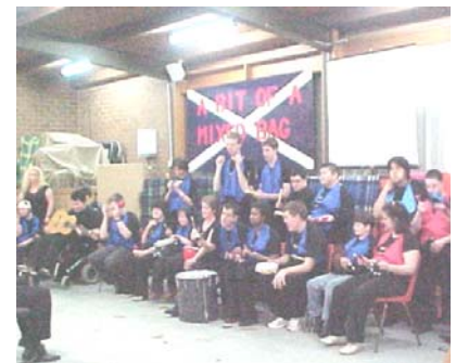
The whole troupe performing a musical item

Clients performed Celtic musical items as well as a humorous drama and a New Zealand Maori Haka thrown in for good measure, which was taken very seriously by the performers.